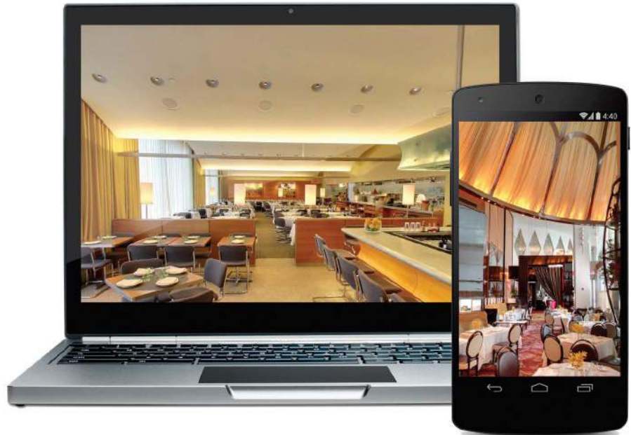
Tour business interiors with Google Maps Business View on desktop, mobile, and tablet devices